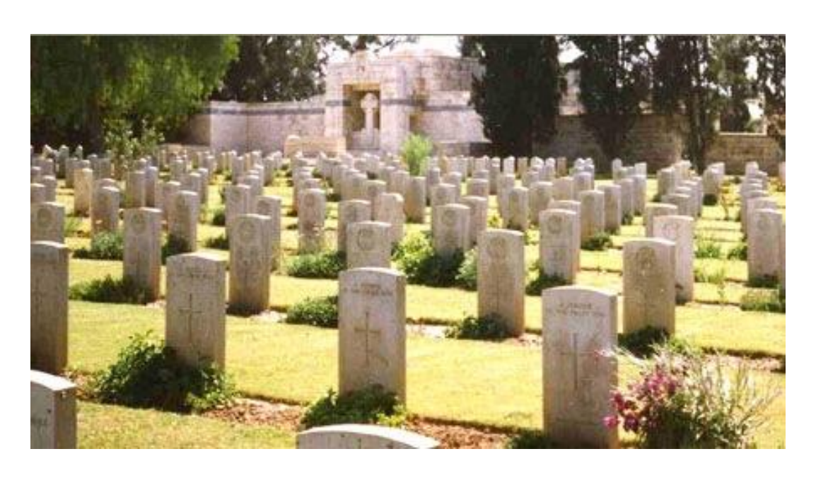
Gaza World War 1 Cemetery