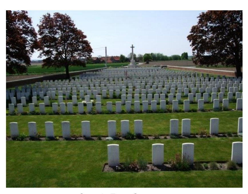
Canada Farm Cemetery

He was posthumously awarded the 1915 Star, British War Medal and Victory Medal.