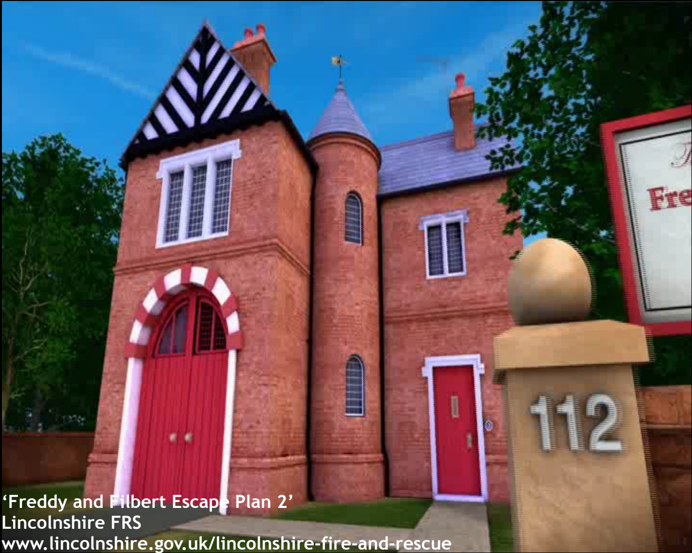
'Freddy and Filbert Escape Plan 2' Lincolnshire FRS www.lincolnshire.gov.uk/lincolnshire-fire-and-rescue