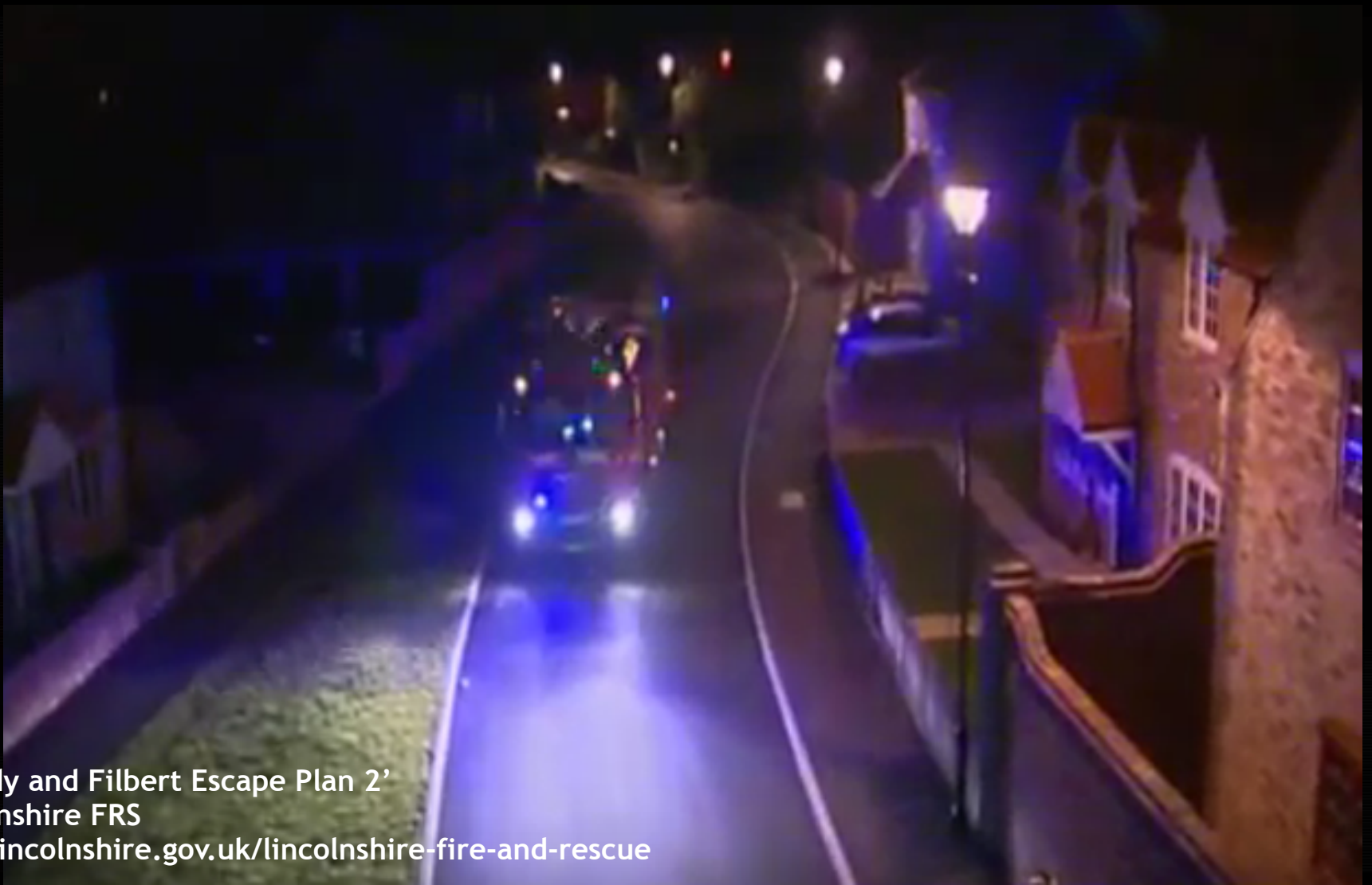
'Freddy and Filbert Escape Plan 2' Lincolnshire FRS www.lincolnshire.gov.uk/lincolnshire-fire-and-rescue